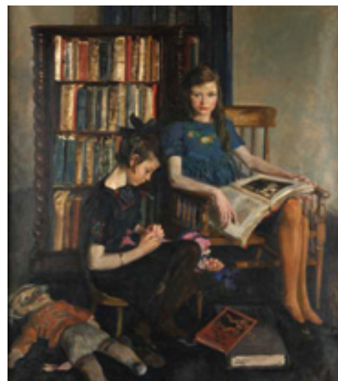
Circle of Sir William Orpen (1878-1931) "Study of two young Girls seated in a library with dolls," O.O.C., bears signature upper right on (book-spine), 39" x 33" (99cms x 84cms). (1) Realised: €10,000.