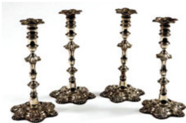
Lot 148: An important set of 4 Irish cast silver Candlesticks, George III period, by John Walker, Dublin c. 1770. (4) Realised: €8,500

The silver section showed great resilience, and some very good prices were achieved; Lot 159, Canteen of Cutlery, €2,400 (Est. €1600/2500); Lot 148, Important set of 4 Irish cast silver Candlesticks €8,500 (Est. €8,000/10,000) and many others.