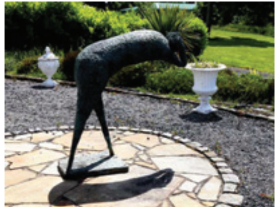
Lot 319 - Edward Delaney R.H.A. (b. 1930) Important large bronze Figure, "Lady Washing her Hair," 49" (125cms). A very attractive Garden Water Feature. (1) Realised: €8,500

In the furniture section there was spirited competition for all lots, including Lot 61, Set of 10 reproduction mahogany Dining Chairs in the Chippendale style, €5,200 (Est. €2500/3500); Lot 62, good quality reproduction triple pedestal mahogany Dining Table, €2,800 (Est. €1200 / 1800); Lot 63, a matched set of 10 mahogany Dining Chairs, €2,800 (Est. €1200/1800); Lot 181, a mahogany bow fronted Settee, €800, (Est. €800 / 1200); Lot 215, pair of heavy cast iron Garden Benches €1,300 (Est. €300/500).