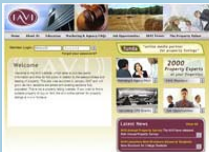
The IAVI website is back online, more modern and streamlined than before.

Visit it and use the Member Section of the site - you should have received an email on how to access this section in February and if you did not receive one, please email valerie@iavi.ie as we may not have your current email address.