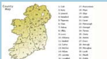
Users can search for IAVI members and firms throughout the 32 counties.